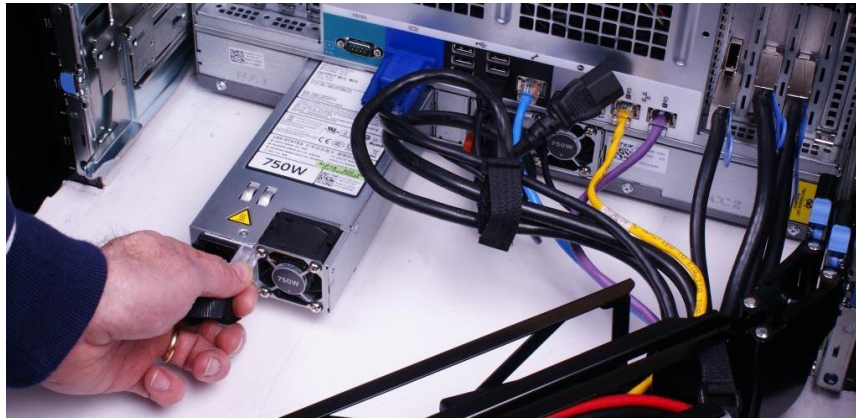
Figure 6. Replacing the power supply