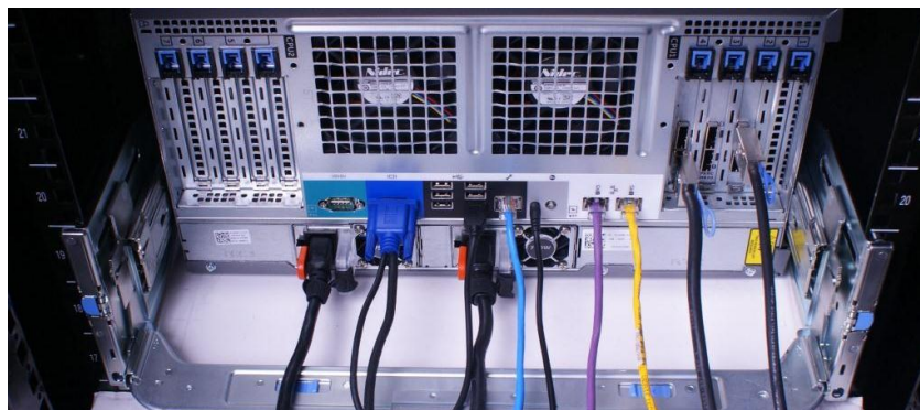
Figure 1. System with cables installed

Attach the CMA tray to the back of the rails as described in the CMA Installation Instructions provided in the CMA kit. Connect all applicable cables to the rear of the system and verify that all connections are secure. See Figure 1.